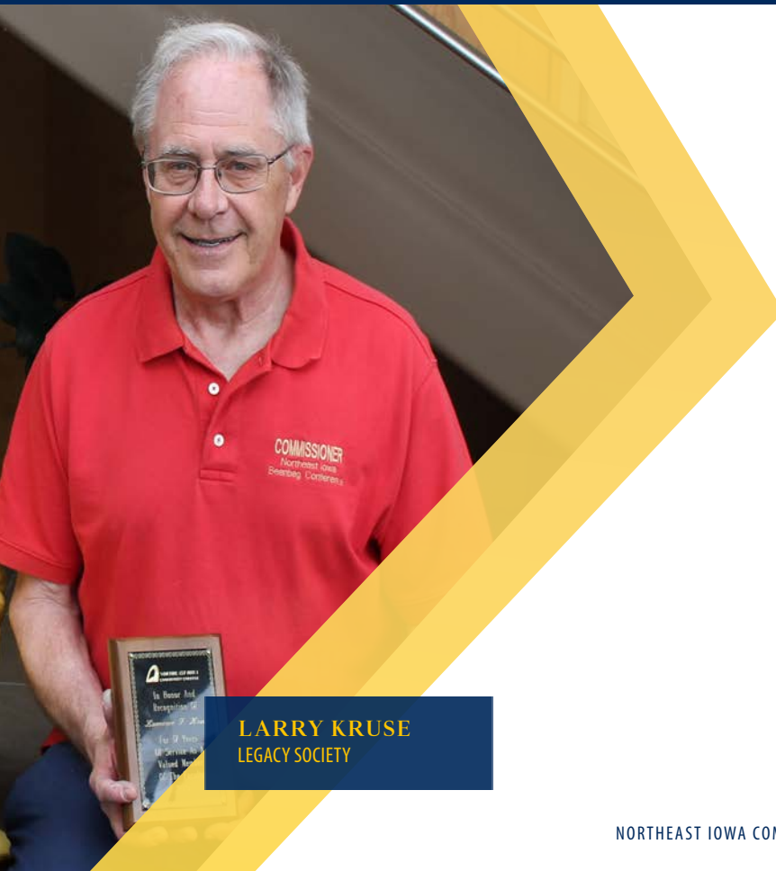
LARRY KRUSE LEGACY SOCIETY